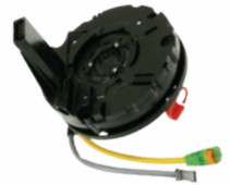
Dodge Sprinter CSP131