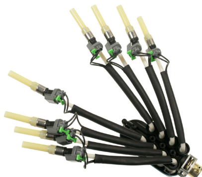
FJ504 Multi-Port Fuel Injection (MFI) System GM V8 4.3L

Tech Tip: For successful installation, lubricate injector tips and O-ring seals with transmission assembly gel, petroleum jelly, or even clean engine oil. Do not use silicone.