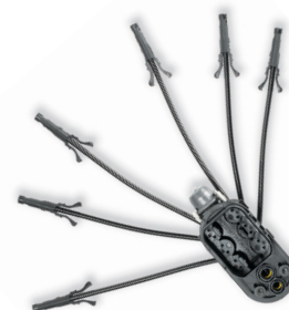
OE SCPI Injection System

GM's Vortec engines come with a Sequential Port Injection System (SCPI). Standard's Multi-Port Fuel Injection (MFI) system has several advantages over the original Sequential Central Port Injection (SCPI) system, including port fuel delivery and high reliability, better hot starts and reduced vapor emissions, and faster prime on hot restarts.