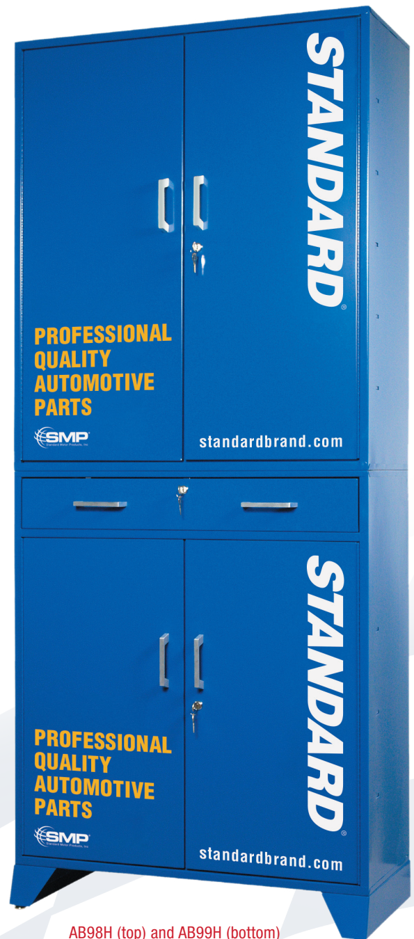
AB98H (top) and AB99H (bottom) Cabinets shown here double stacked on AB98L Base